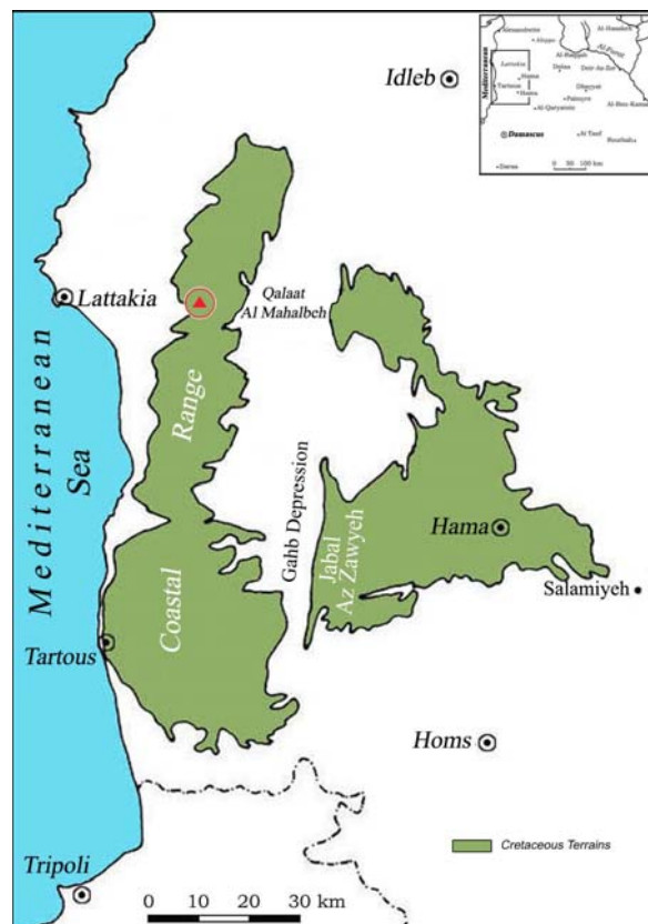
Figure 1. Location map of Qalaat Al Mahalbeh.

A six open joints set (Figure 2-1 & 2-4) was detected in one of the Upper Campanian hemi pelagic marly and clayey limestone levels, locally impregnated by organic matter, Bearing small benthic and little plankton foraminifer at Qalaat Al Mahalbeh, Coastal Range. The N52°E oriented joints widen (3-10 cm) (Figure 2-4) generally northwestwards.